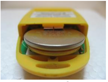
4. Insert new battery, 5. Push battery positive (+) side facing up.