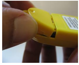
6. Replace cover, as shown. Cover will snap into place. Replace screw.