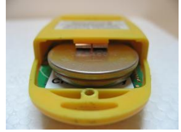
forward as far as it will go.